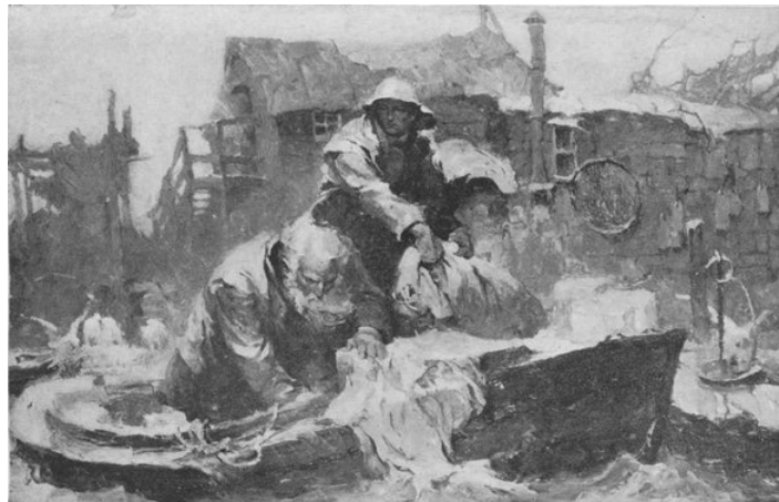
The long, black launch nosed its way out to sea.

oil lamp on the table when into the frame of an inner door came Ericksen himself, with his huge, bent shoulders, his massive head, his fierce eyes, and a great gray beard streaming over his naked chest. He stared for a moment, and Alan flung off his hat, and as the storm broke, beating upon the cabin in a mighty shock of thunder and wind and rain, a bellow of recognition came from Ericksen. They gripped hands.